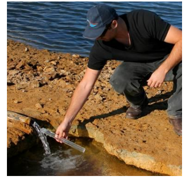
Regional trends in salinity and water levels for prescribed groundwater resources

This report summarises whether changes in groundwater levels and salinity of prescribed groundwater resources are within acceptable limits. This report should be read alongside reports on the sustainable use of ground water resources.