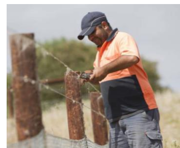
Trend in involvement of Aboriginal people in natural resource management

In South Australia the unemployment rate of Aboriginal people was about three times higher than for non-Aboriginal people, 2005-11. The Government of South Australia aims to increase Aboriginal employment in all public sector agencies to at least 2 per cent across all levels. DEWNR has an additional target of at least 3 per cent.