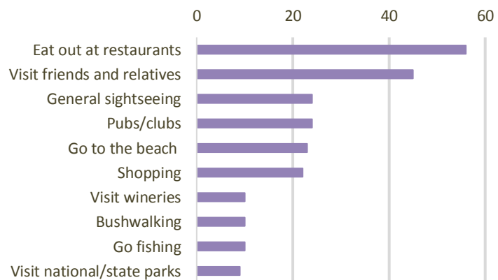
Percentage of domestic visitors that participated in an activity (visitors can participate in multiple activities)

Reliability of information ★★★★★ Very good