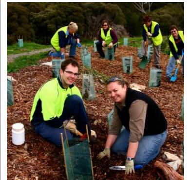
Trend in volunteer involvement

In the Adelaide and Mount Lofty Ranges NRM region, volunteers are involved in projects on both private and public land, including national parks, conservation parks and reserves. Volunteers assist with re-vegetation, soil and land management, native animal and plant surveys, fire management, trail maintenance, weed and pest animal control, heritage site restoration, public education, fundraising and assisting in project administration.