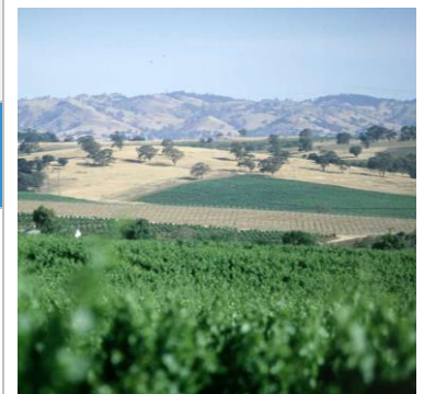
Trends in water application rates in irrigation areas

This report tracks the amount of water applied per hectare, and trends in methods of irrigation.