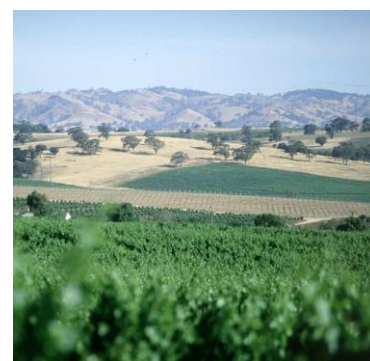
Trends in water application rates in irrigation areas

This report tracks the amount of water applied per hectare, and trends in methods of irrigation.