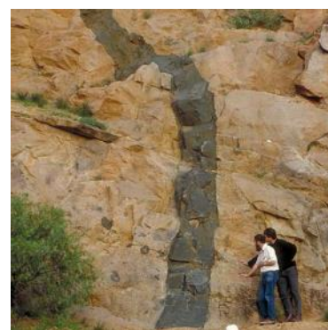
Trends in the condition of geological features

The condition of geological heritage sites may be diminished by inappropriate land use and development, or unrestricted access to vulnerable landforms. It is important to note the value of some features can be enhanced by mining excavation or civil constructions as well.