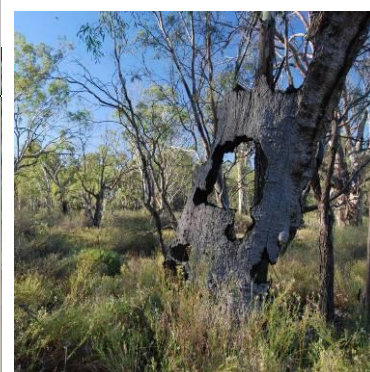
Trend in the condition of native vegetation

Increase extent and improve condition of native vegetation