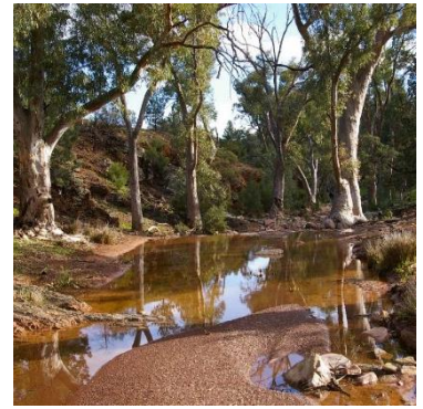
Trends in the ecological condition of rivers and streams

In 2008 and 2013, the Environment Protection Authority assessed the condition of rivers and streams in the Kangaroo Island NRM region based on water quality and the condition of invertebrate and plant communities. Assessments have been made at 33 sites, across the Kangaroo Island catchment. This report card summarises the information by catchment basins.