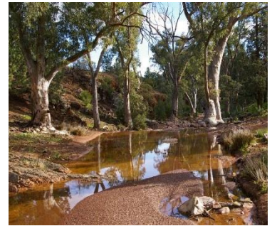
Trends in the ecological condition of rivers and streams

In 2012, the Environment Protection Authority assessed the condition of rivers and streams in the South Australian Arid Land NRM region based on water quality and the condition of invertebrate and plant communities. Assessments have been made at 57 sites, across the Cooper Creek, Diamantina River, Finke River, Lake Frome and Lake Torrens catchments. This report card summarises the information by catchment basins.